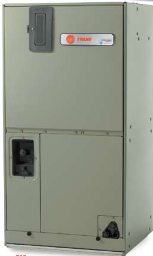
TEE ComfortLink™ II Communicating Capability with Built-In Trane CleanEffects

Precision engineered to deliver comfort throughout your home.